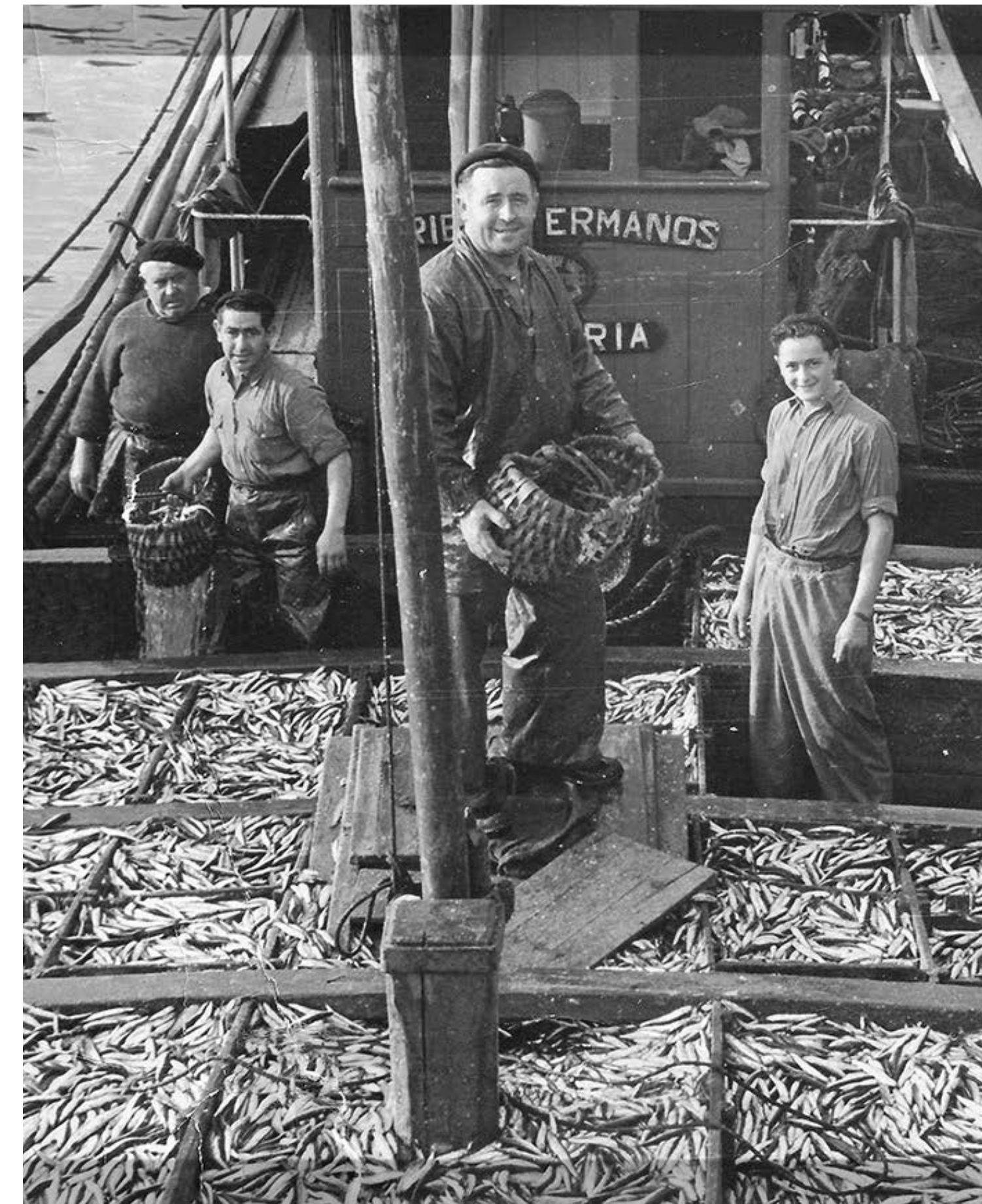
Canned fish straight from the Bay of Biscay